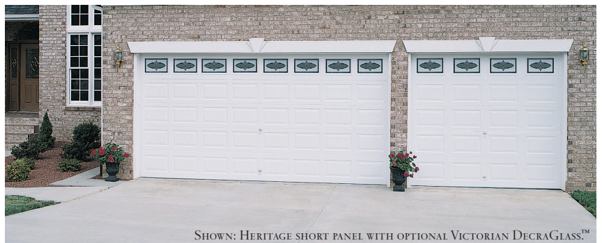
SHOWN: HERITAGE SHORT PANEL WITH OPTIONAL VICTORIAN DECRA GLASS.™

THE HERITAGE SERIES FEATURES A LIMITED LIFETIME WARRANTY ON PAINT & FINISH, AND 3-YEARS ON HARDWARE.