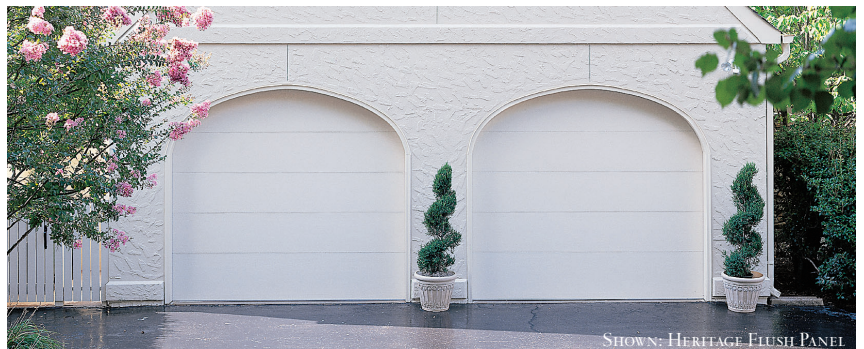
SHOWN: HERITAGE FLUSH PANEL